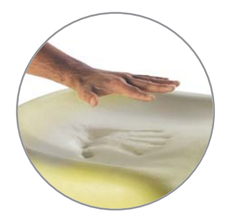
Memory Foam (MF): Slow release memory foam evenly distributes body weight, helping to minimize pressure points and ease blood circulation. Optional

Ergonomics is the study that deals with the interaction between humans and their activities. It is the practice of designing an environment to adapt to the characteristics of the people who are within it.